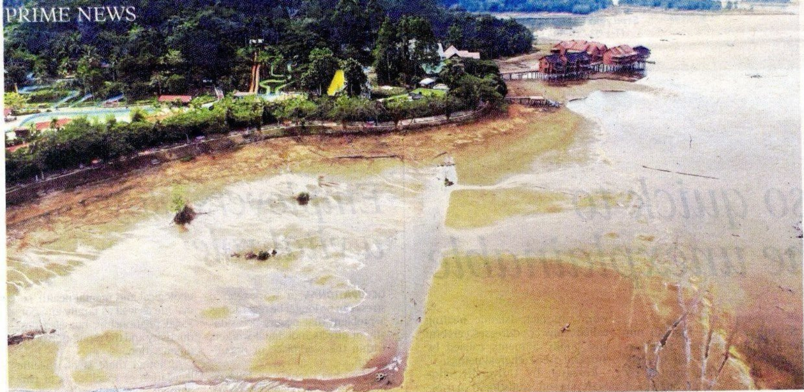
An aerial view of the partially dried-up Bukit Merah Lake in Perak yesterday.